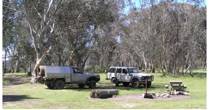
Davies Plain Hut camping area

It wasn't long before camps were erected and maintenance began on some vehicles.